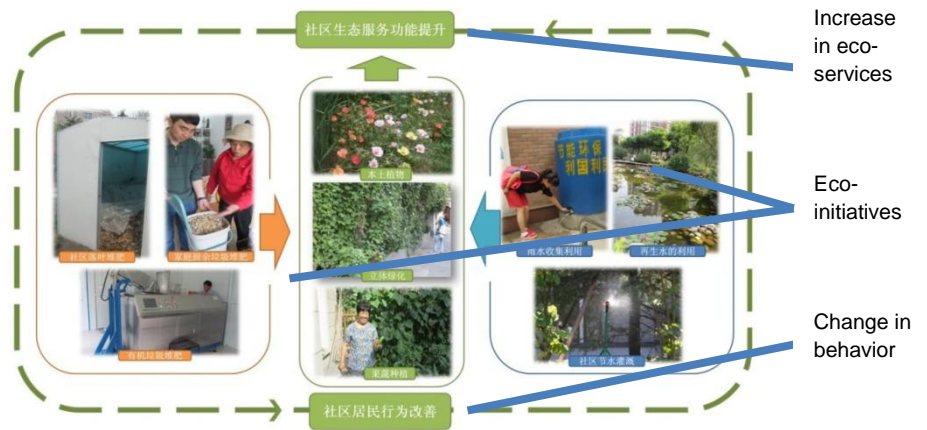
Figure4: Breakdown of different elements of Vantone's Eco-Community Model