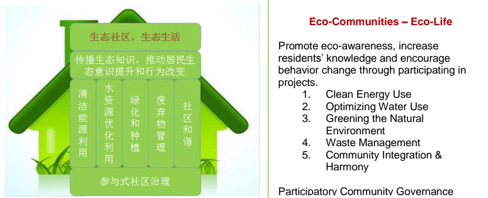
Figure1: Vantone's Eco-communities Model

The Vantone Foundation (Vantone) promotes environmental protection and Eco-community building in urban communities. Founded by Vantone real estate group and Vantone Holdings Co., Ltd, Vantone has spent the past four years developing an innovative eco-communities program (see Figure 1) called Eco-Communities – Eco-Life. The program combines theory and practical projects in residential communities—in close cooperation with grassroots nonprofits and community stakeholders.